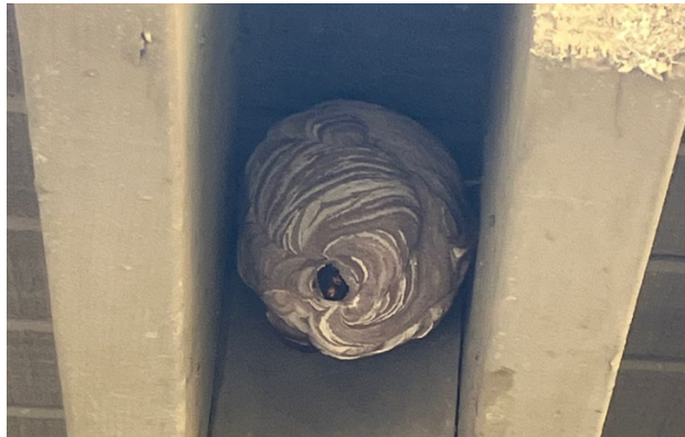
Primary nests found and eradicated from Skidaway Island in May 2026.