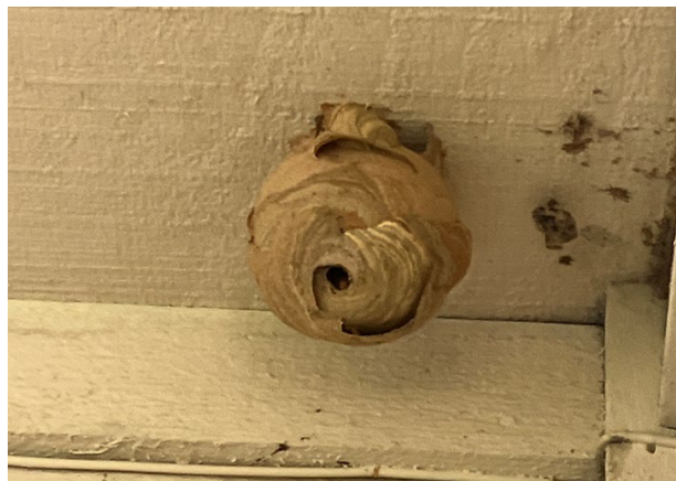
Primary nest found and eradicated from Wilmington Island in May 2026.