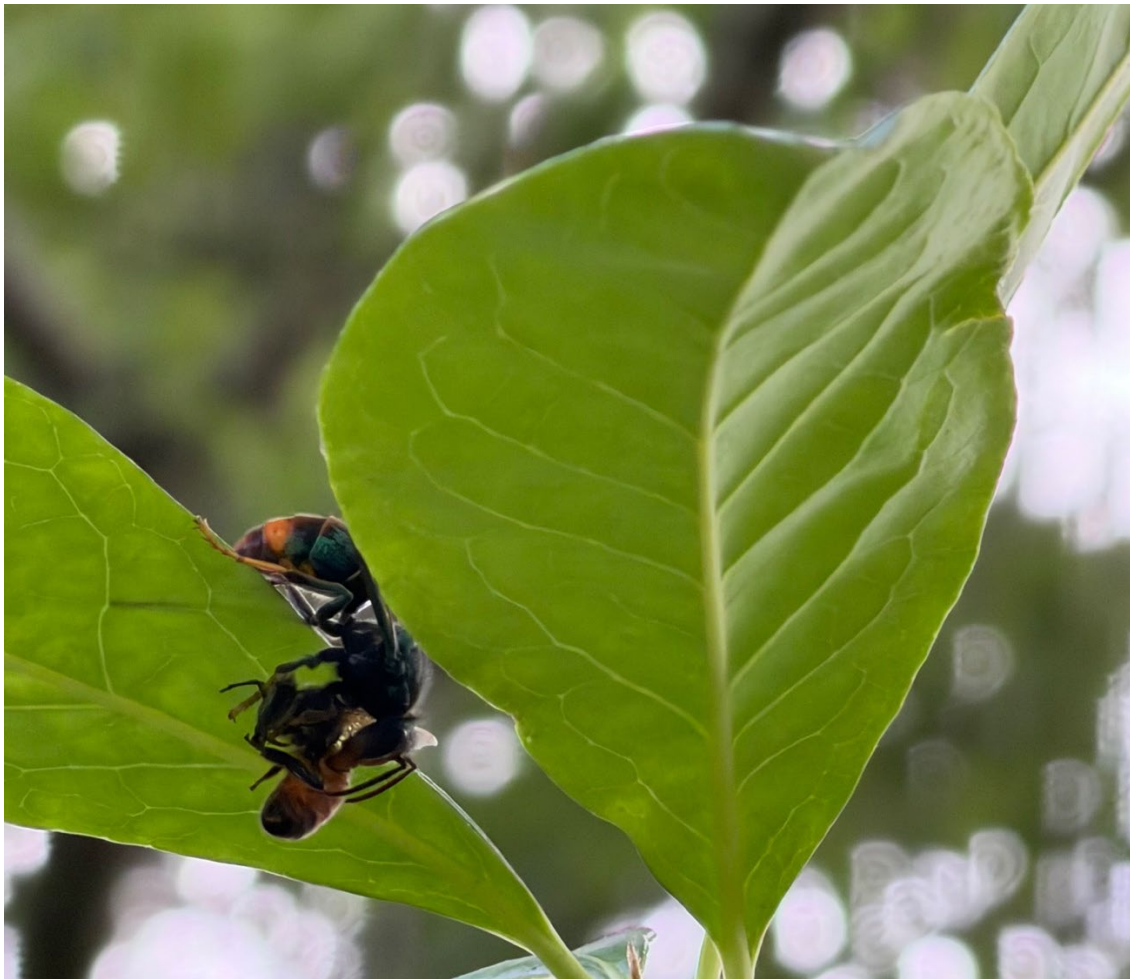
A Yellow-legged Hornet with a bee in Talahi Island.

Since our last update, the Plant Protection team has observed increased hawking activity around beehives, a sign that the Yellow-legged Hornet is beginning to transition into its secondary nesting phase. As activity increases, it is more important than ever for Georgians to remain vigilant and watch for nests like those pictured below. If you suspect you have identified a Yellow-legged Hornet nest or notice hawking behavior around your hives, please contact the Plant Protection team at yellow.legged.hornet@agr.georgia.gov .