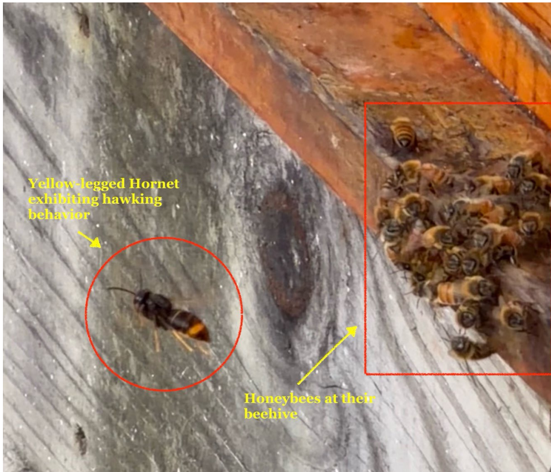
A Yellow-legged Hornet exhibiting hawking behavior.