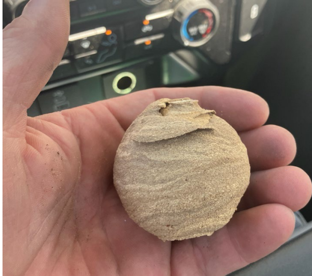
Abandoned Embryo Nest found in May 2026.